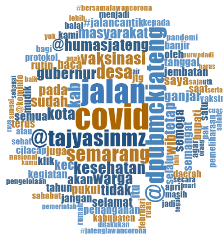
Figure 2. Word Cloud of Ganjar Pranowo's Social Media

The communication of the Governor of Central Java through social media is very intense, ranging from answering public complaints to disseminating important information about government conditions. The transformative ability of social media technology has great potential for the government sector, the potential will increase when collaboration between government, researchers, business, and society is created (Bertot et al., 2010). The government's ability to utilize social media technology in achieving active communication with the community has been carried out by the Central Java government.