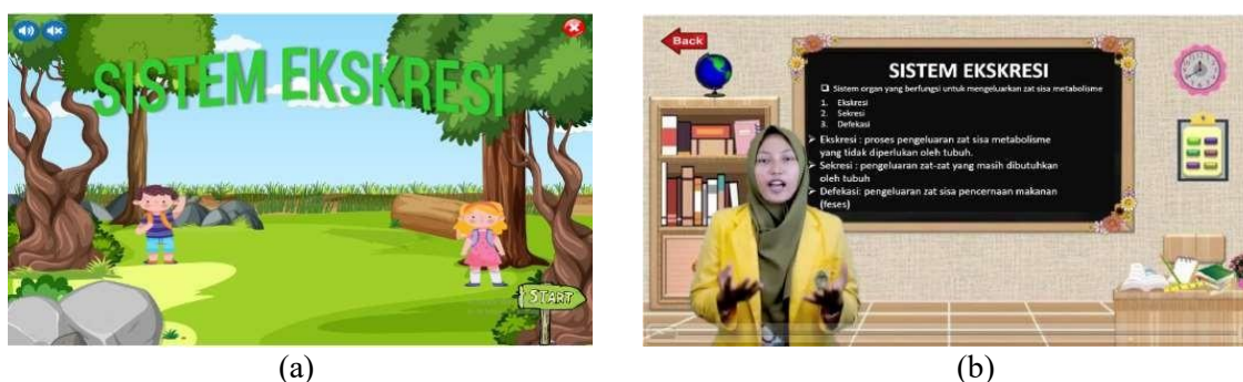
Figure 2. (a) Initial display of interactive learning media; (b) Initial display of interactive learning media

The developed natural science multimedia for excretory system content is based on interactive Adobe CS Flash design. The use of such electronic media is expected to improve student focus and engagement with the presented content. The validity of the media was assessed through expert evaluation. Several revisions were made following validator feedback. The validity of the Android-based science multimedia was evaluated across several aspects: media, material, video content, and language. The figures below illustrate the initial display of the learning media designed for the excretory system, which was implemented across four learning sessions.