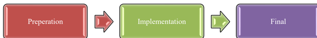
Figure 1. Research procedure in this study

The research procedure was implemented through three sequential stages, as illustrated in Figure 1. The preparation stage involved coordinating with schools, validating instruments, and obtaining ethical approval. The implementation stage included administering the learning-needs questionnaire and creative thinking test to students under teacher supervision, as well as conducting teacher interviews. The final stage consisted of data processing and analysis.