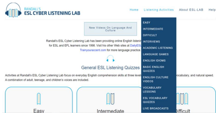
Figure 1. ESL Lab features

To analyze how Randall's ESL web could be used as a digital platform to help the students' in comprehending the listening part, the researchers introduced the features of Randall's ESL web in Figure 1.