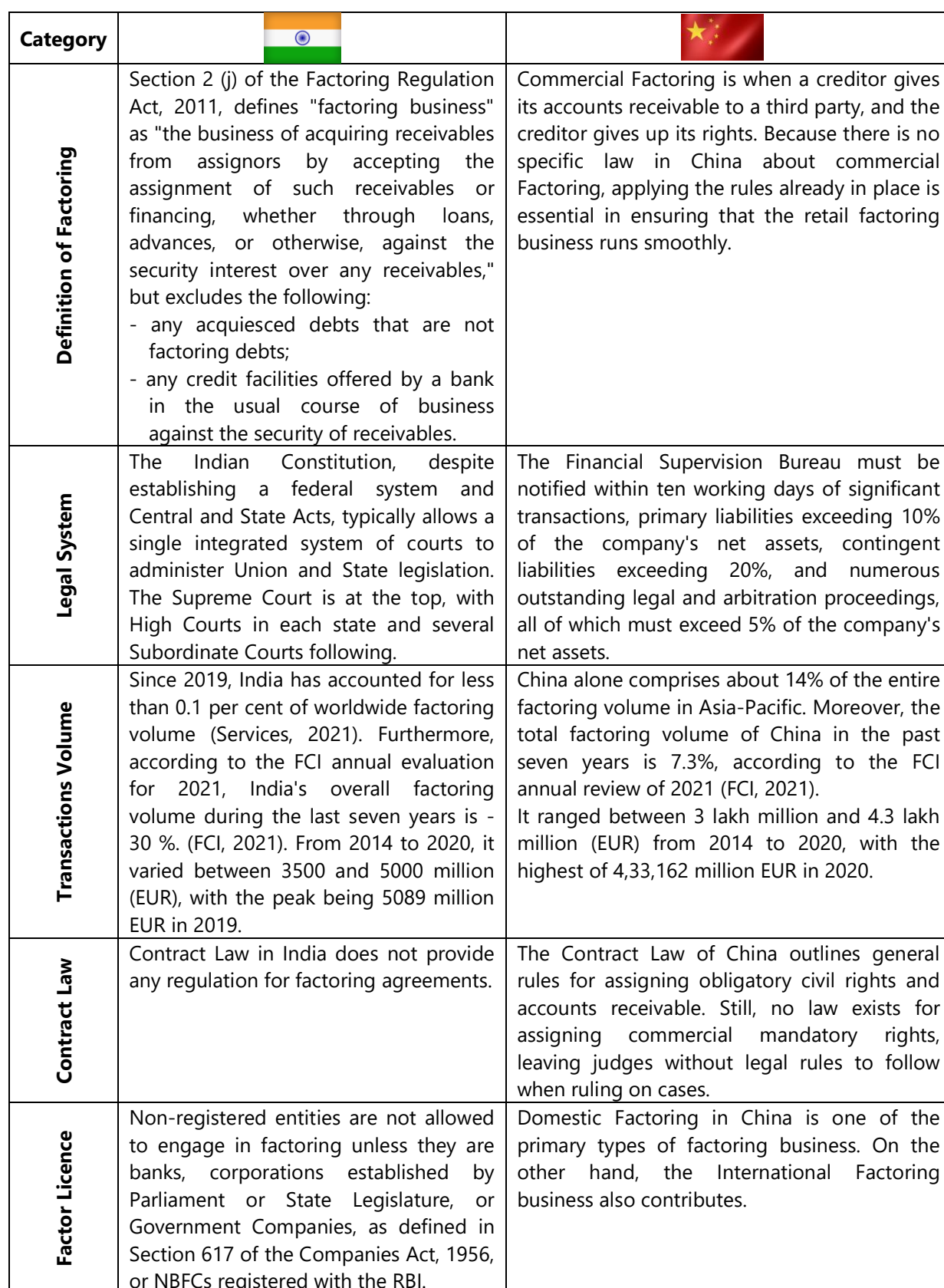
Table 1. Comparative Analysis India and China