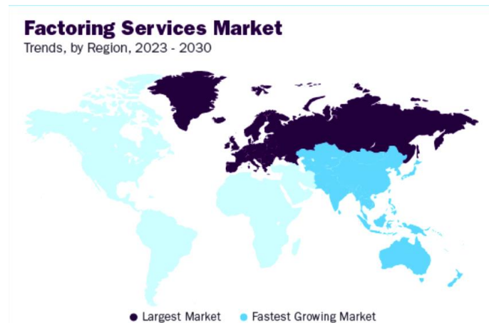
Figure 2. Factoring Services Global Market Share 2023

As per Figure 2, The Asia Pacific region comprises many emerging economies, including but not limited to Thailand, China, the Philippines, and India. These economies are receiving investments from developed markets that are already saturated, and these markets are investigating potential new opportunities in the region by utilising factoring services.